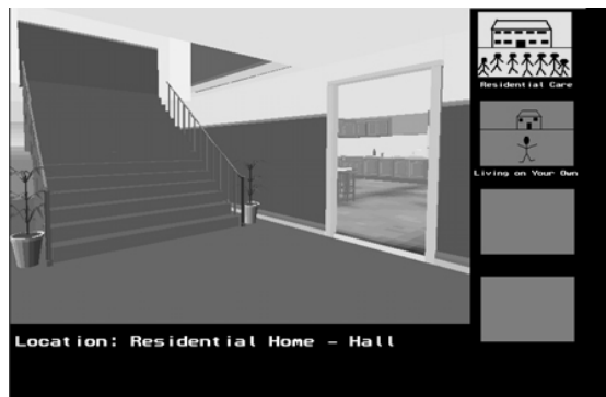
Figure 3. Exaggerated size of door and stairway.