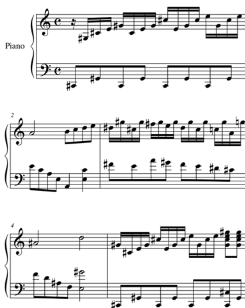
Figure 2. An example of a generated mixture of Robert Schumann and Ludwig van Beethoven.

((CLOSE 'PITCH 'PREV-PITCH-LEADING) (CLOSE 'PITCH-CLASS 'PREV-PITCH-CLASS-LEADING) (EQUAL 'COMPOSER EEG-SET-COMPOSER))